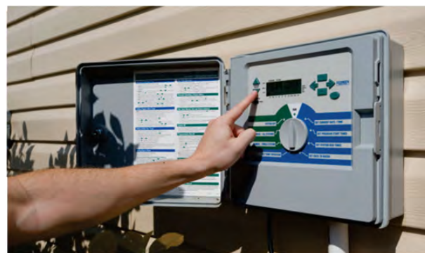
WaterSense labeled irrigation controller