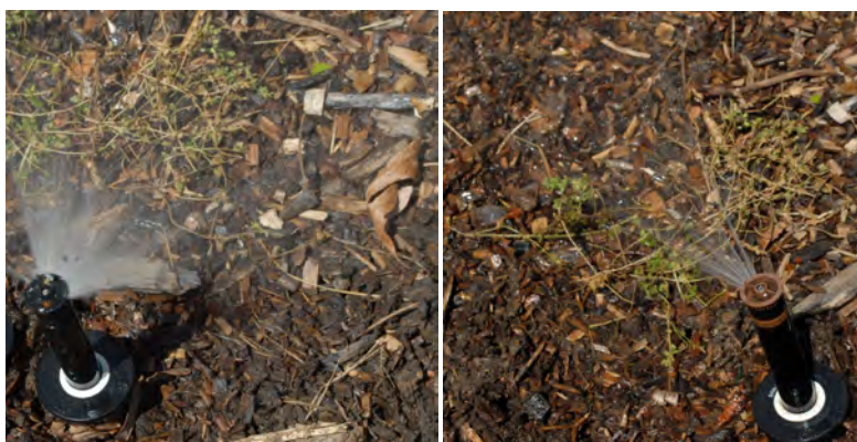
The image at left shows a spray sprinkler with a body that is non-pressure-compensating, resulting in water wasted from misting and overwatering. The image at right shows a pressure-regulating spray sprinkler body that regulates the water pressure to the sprinkler nozzle's optimal pressure.