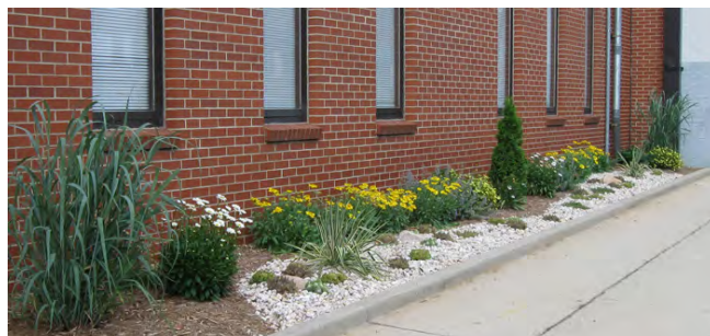
Avoided strip grass.